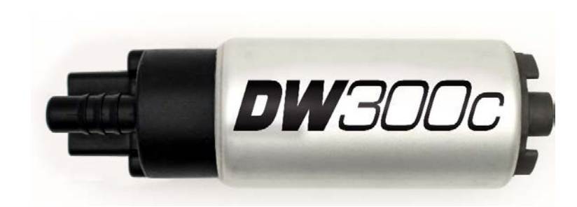
PN 9-307 represented in above photo

The 340lph DW300c offers the highest flow available in a compact fitment pump. The compact fitment allows drop-in fitment into may popular applications such as WRX, R35 GTR, EvoX, CTS-V2, and BRZ/FRS. Quiet operation and pulse width modulation compatability are delivered via the turbine impeller and computer balanced armature. E85 compatability is built in via the carbon commutators and a fully encapsulated armature. All DW fuel pumps are backed by a 3-yr no fault warranty.